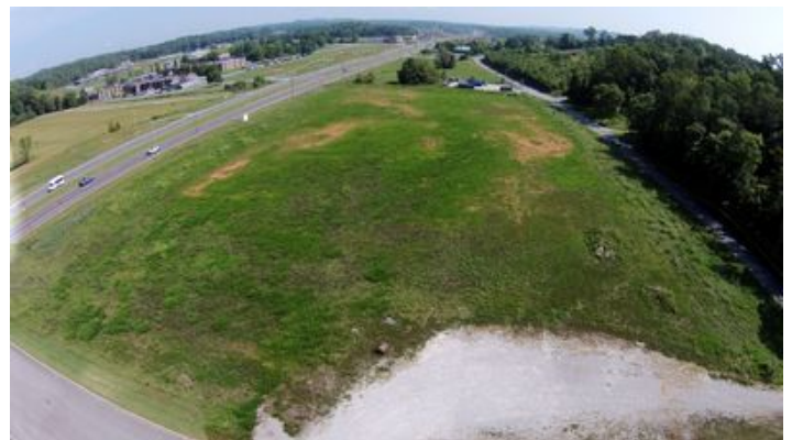
Glen Alpine 3