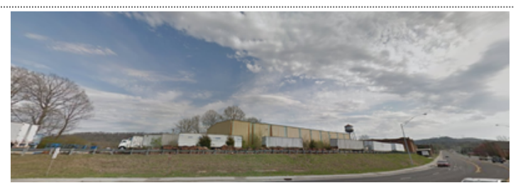
MMs front view 6