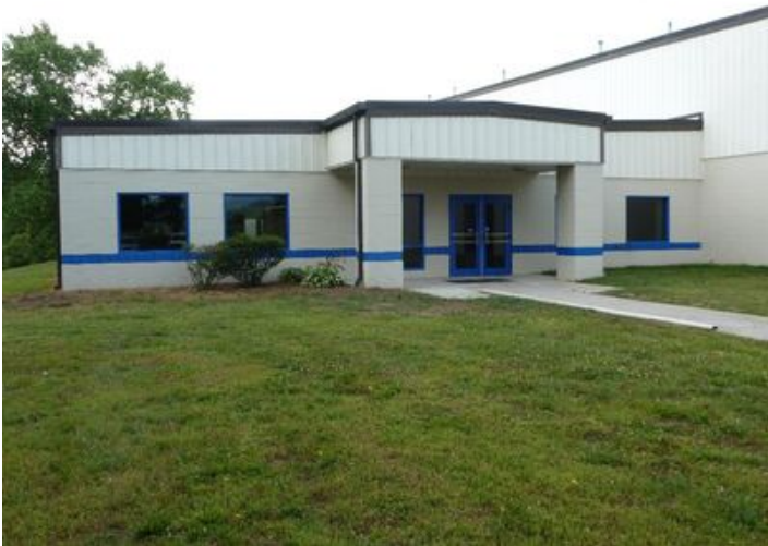
Eagle Way Entrance