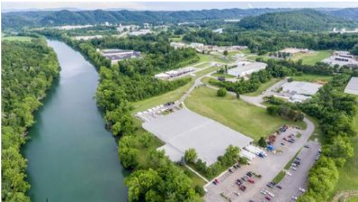
Eagle Way Aerial