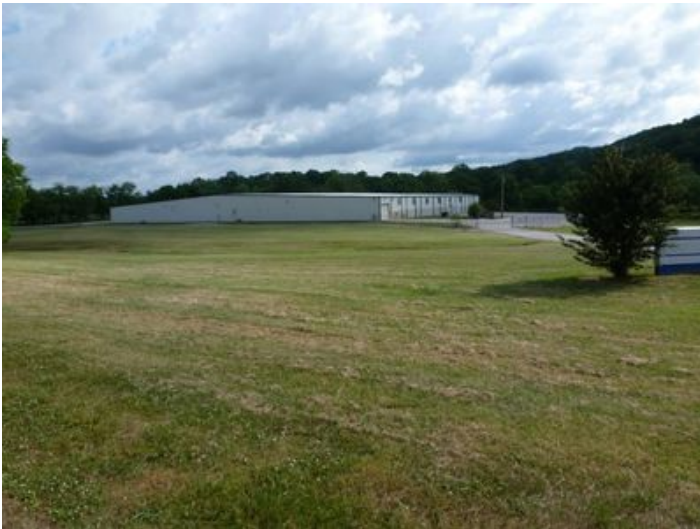
Eagle Way Field