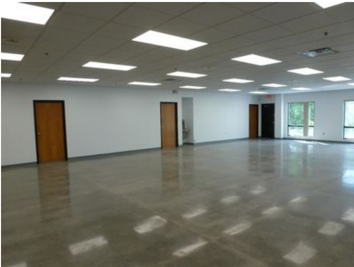
Eagle Way Interior