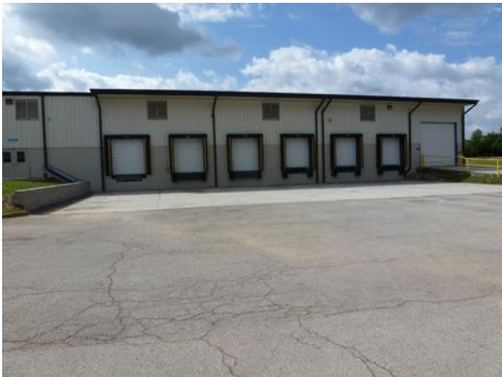
Eagle Way Docks