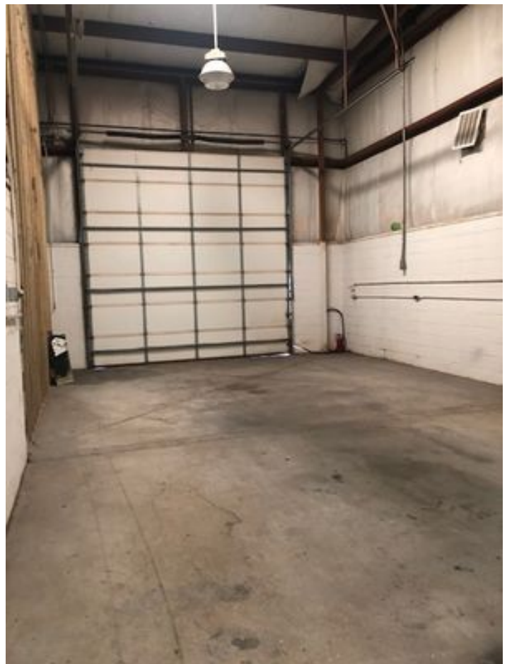
5. Drive through roll up