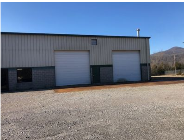
3. Drive through bays