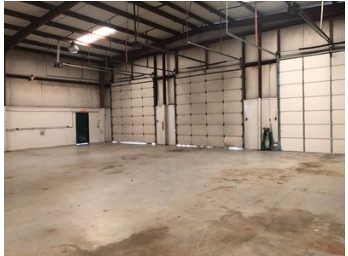
4. 3600SF open span