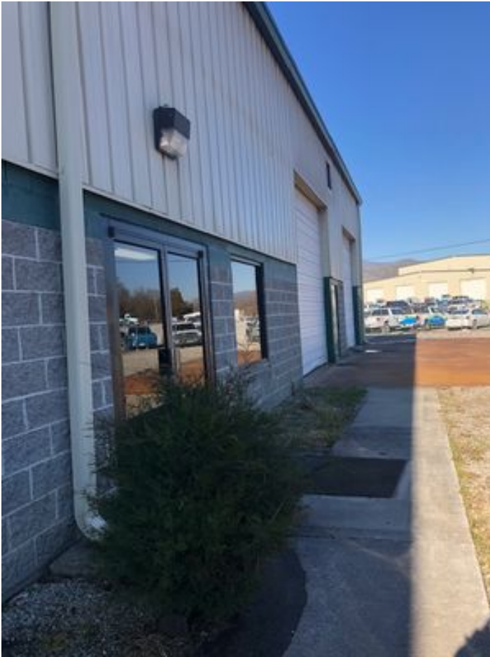
2. Front Entry