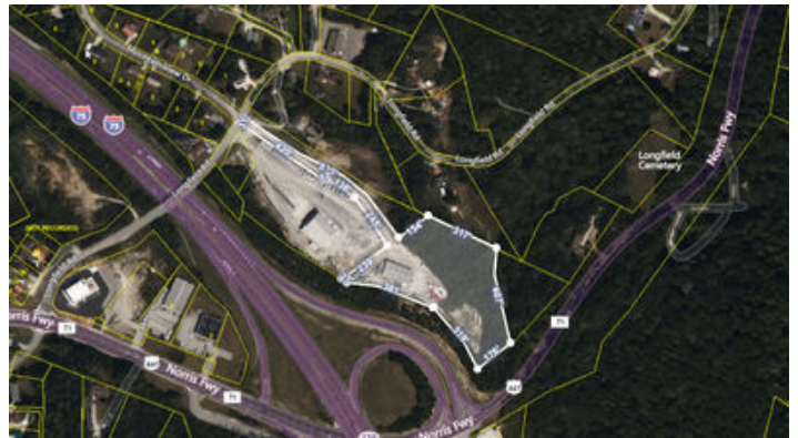
9. Aerial View