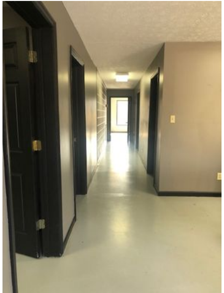
8 Office Corridor