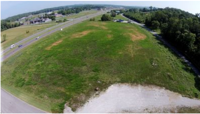
Glen Alpine 3