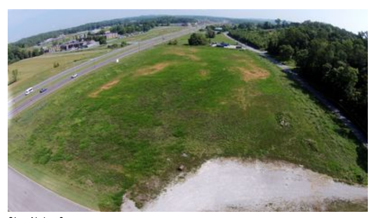
Glen Alpine 3