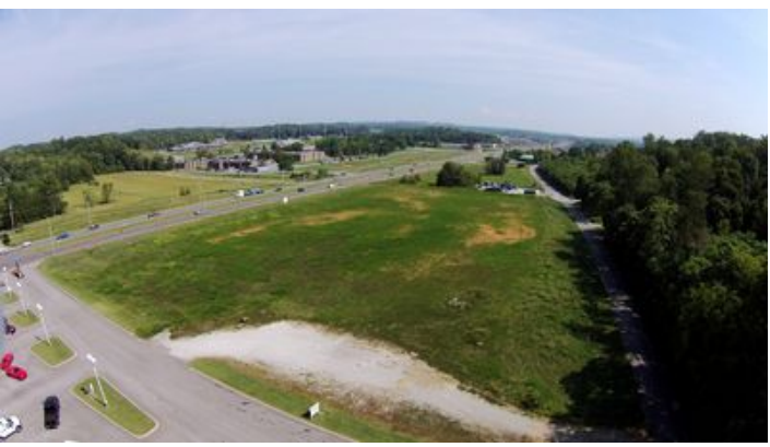
Glen Alpine 2