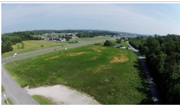
Glen Alpine 1