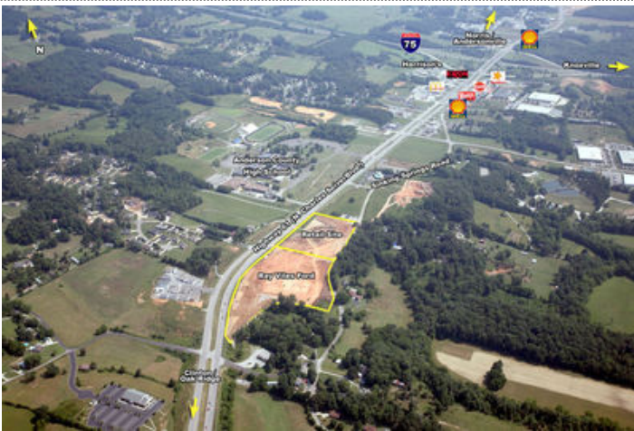
Glen Alpine Aerial