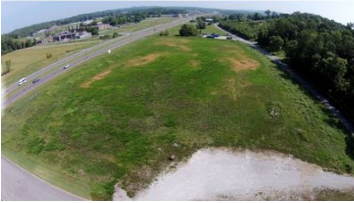
Glen Alpine 3