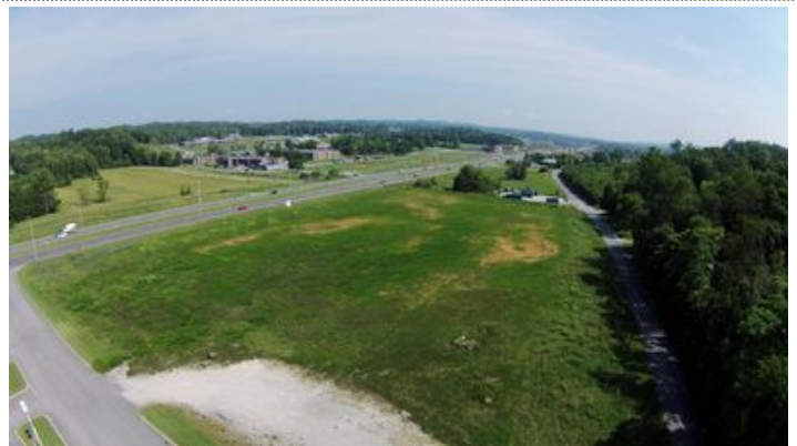
Glen Alpine 1