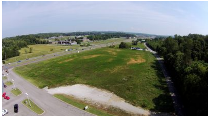
Glen Alpine 2